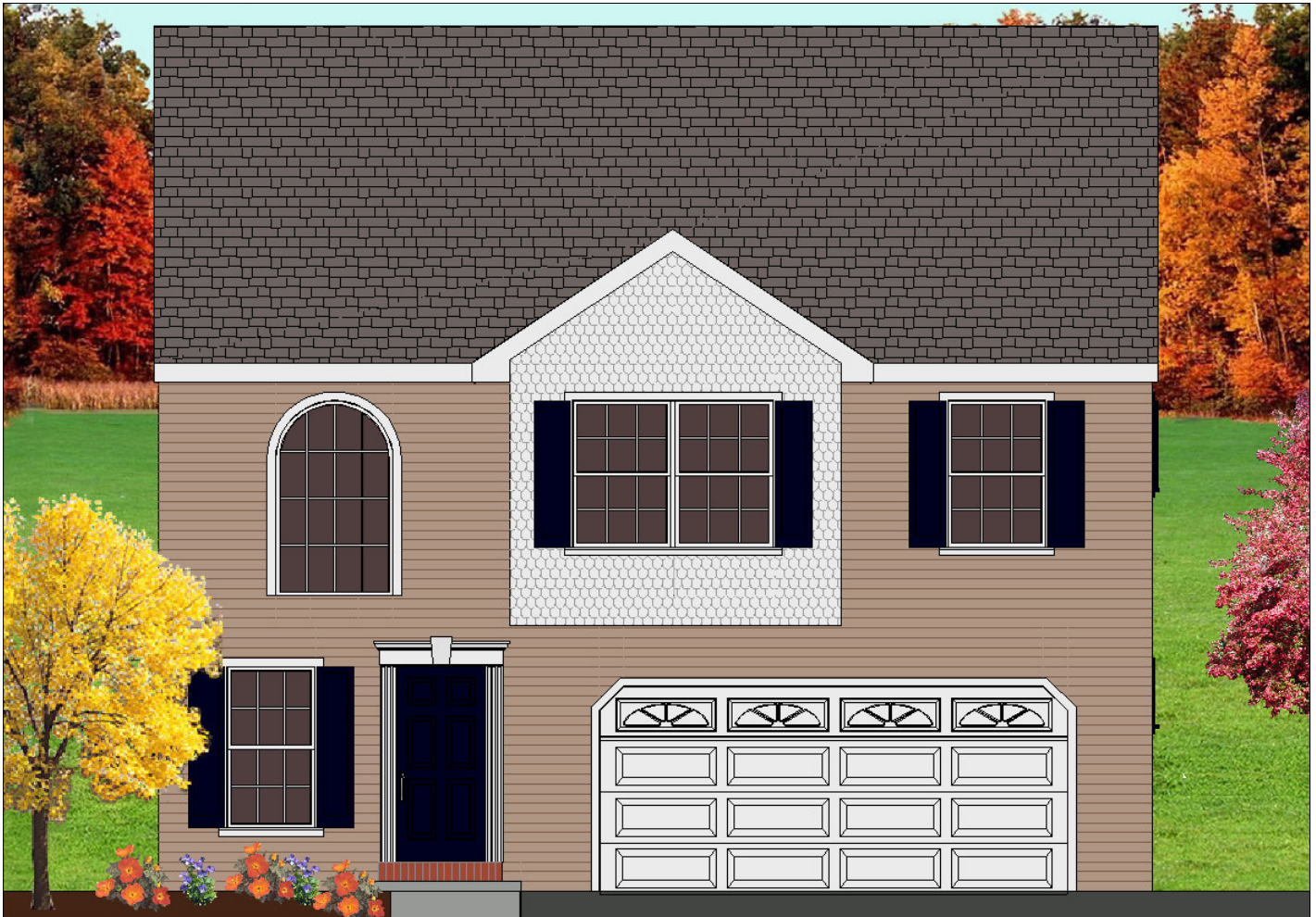
Options Shown: Cedar Impressions Siding, Garage Door Glass, Front Door Surround