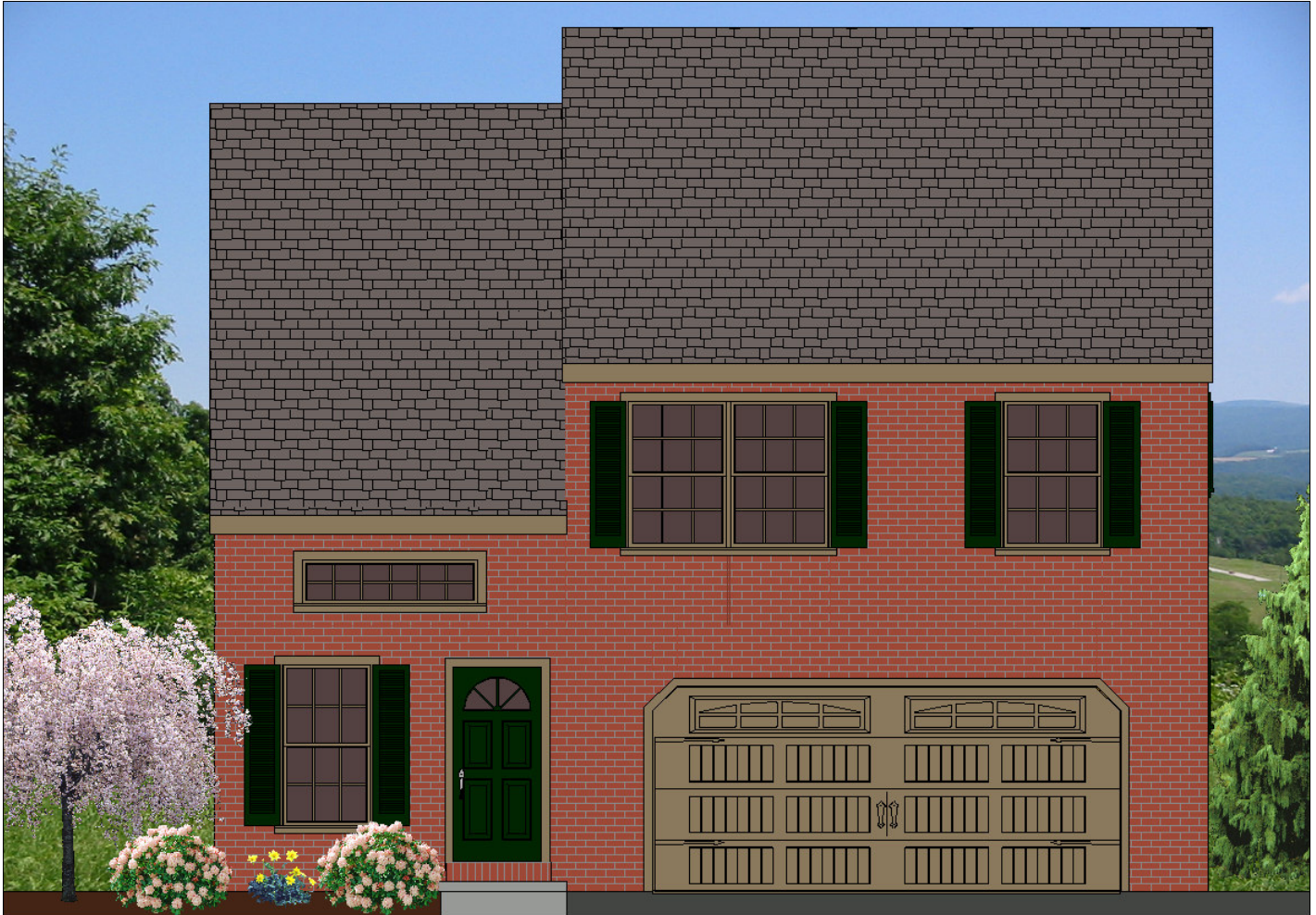
Options Shown: Brick, Garage Door Glass, Carriage House Garage Door, Front Door Glass