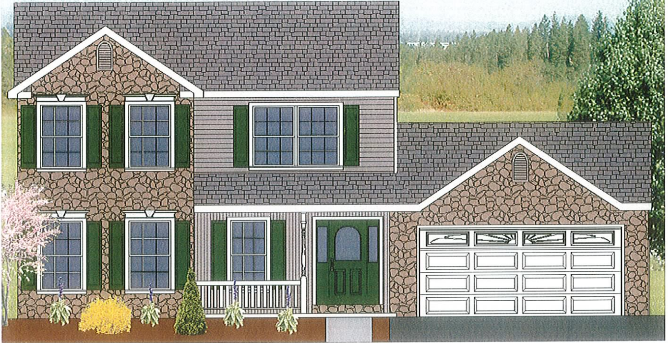
Options Shown: Stone, Vertical Siding, Front Door Glass, Garage Door Glass, Window Trim, Roof Returns