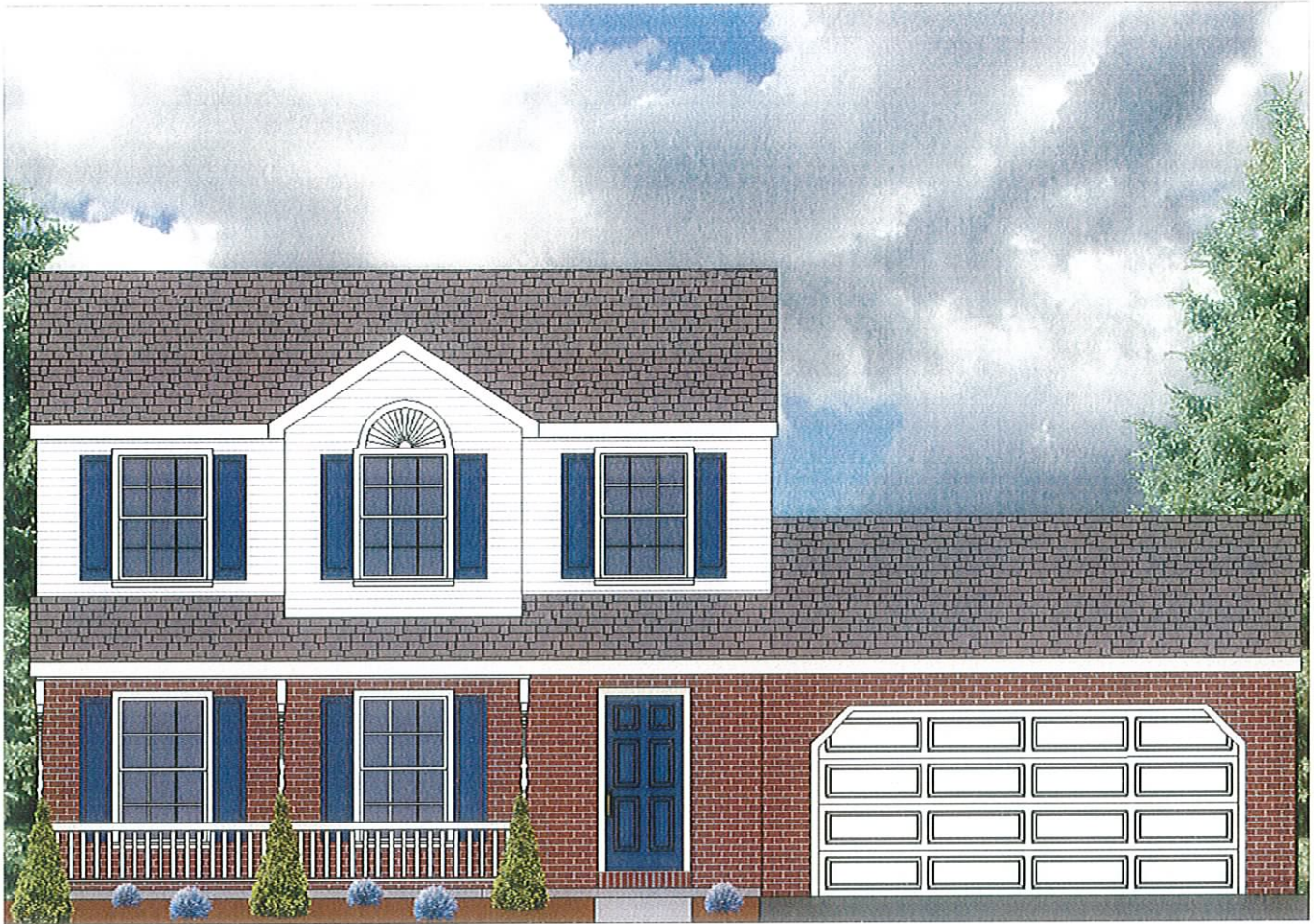
Options Shown: Brick