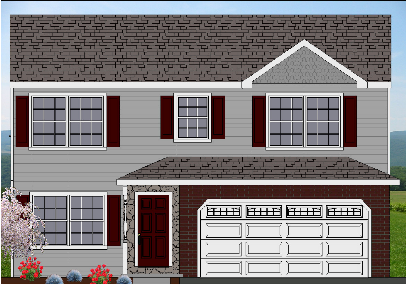
Options Shown: Brick, Stone, Cedar Impressions Siding, Garage Door Glass